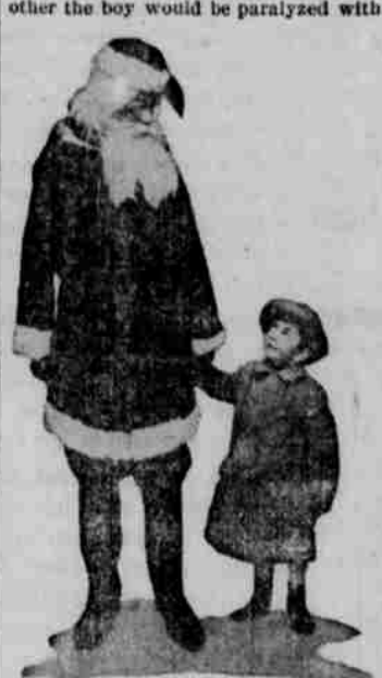
TAKING SANTA TO KINDERGARTEN.