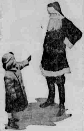
"I WANT THAT."

WE had all agreed that Mr. O'Shaughnessy was the very one to be Santa Claus at our Christmas tree. "No," he said, "No!" We had never seen Mr. O'Shaughnessy so vehement before. "That is one thing I will never do—no, not if the czar of Russia were to command it!" "Why?" asked some one from a safe distance. "Because I played the part once, and I will never do it again. I may as well tell you about it, and then you'll know that it is of no use to bother me about it any more." "One Christmas I was broke, I was hungry, and my feet were on the ground. I had asked a thousand people for something to do, anything to