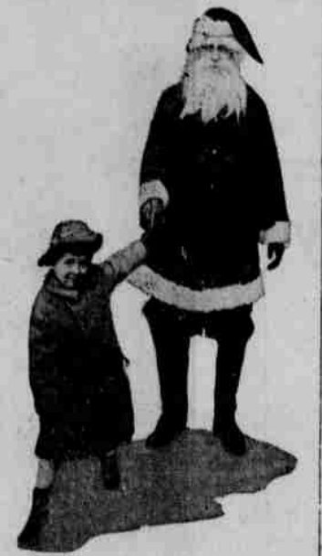
"HE TOWED ME THROUGH THE AISLE."

big, fat butler shoving my chair around for me and waiting on me. I got some birds and one thing and another under my pillow and my furs, but I was awful warm." "It was too warm for comfort when it got around that there was a real, live Santa Claus at the Van Veegle house. All the children came from all over the neighborhood to maul me." "But young Van kept a tight grip on