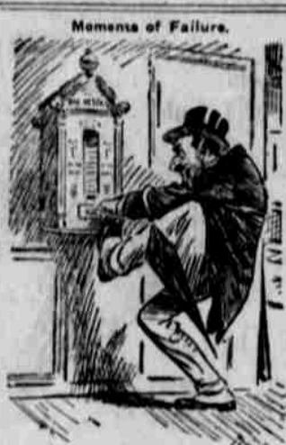
The prince of finance gets the worst of a business deal.—Punch.