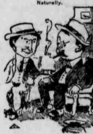
R. E. Former—How are you getting along since you quit your crooked ways?