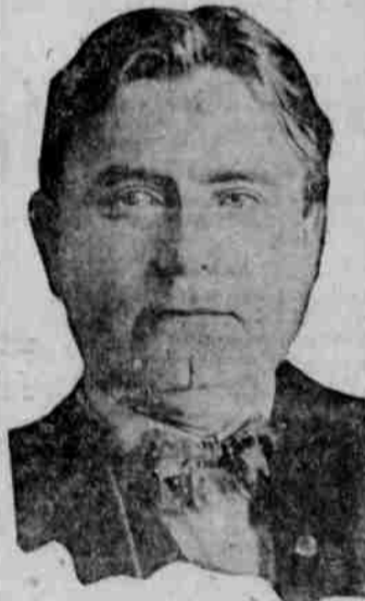
W. E. BORAH

Kansas in Doubtful Column. In Kansas, where Governor Stubbs, Progressive, is battling with Senator Curtis, standpat Republican, it was indicated at a late hour that both might be defeated and the state go