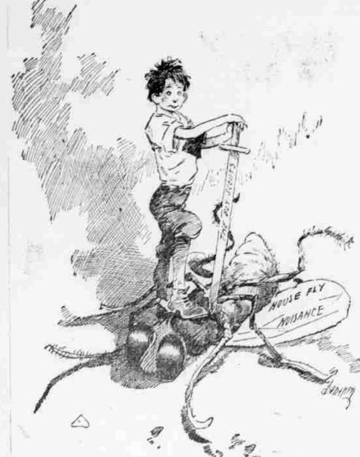
—Donahy in Cleveland Photo Dealer.