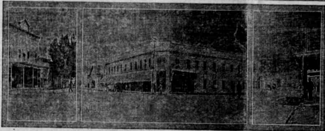
Prineville Hotels—The Best in Central Oregon

It is figured by Mr. Wilson that the line completed and equipped will cost about $350,000. The road will cross Crooked river below O'Neil and will touch Prineville on the north side of the Ochoco.