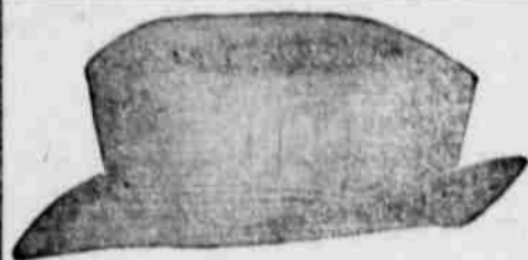
Men's hats in the newest and staple shapes. All $3.50 hats for $2.75. Stetson $5.00 hats for $4.00.

36 in. black taffeta silk, regular $1.00 per yard. . . . $ .80 30 in. black taffeta silk, regular $1.50 per yard. . . . $ 1.20 These are exceptional values at the regular prices, and are bargains at the prices we are offering them now.