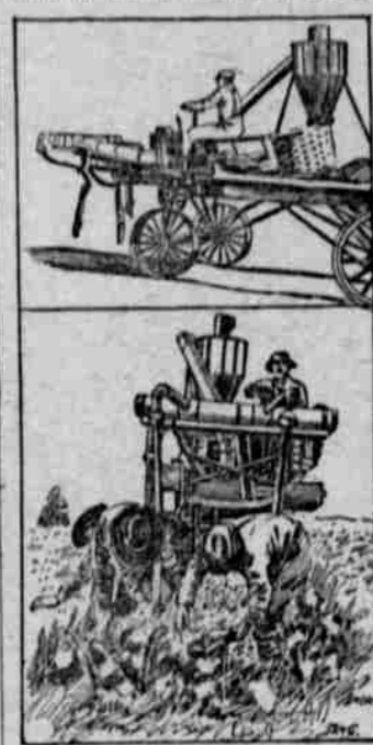
SIDE VIEW OF PICKER AND MACHINE AT WORK.

Machine Gathers and Cleans the Fiber in One Operation. The electric cotton picking and cleaning machine shown in these illustrations has been recently tried out, with success. It is claimed, in Mississippi, says Popular Mechanics, that the majority of cotton picking machines that have appeared in the past few years, this machine is not an automatic picker, but requires boys or men to handle its picking units. The cotton is extracted from the boll by