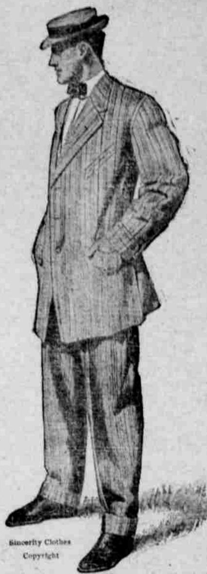
Sincerity Clothes Copyright

We are also offering our stock of boy's and young men's suits at exceptionally low prices.