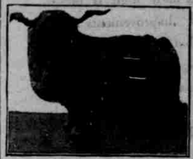
A STURDY FELLOW.

The result is that they have practically killed nearly all the brush in the course, either by eating it up entirely or by breaking, as in the case of the