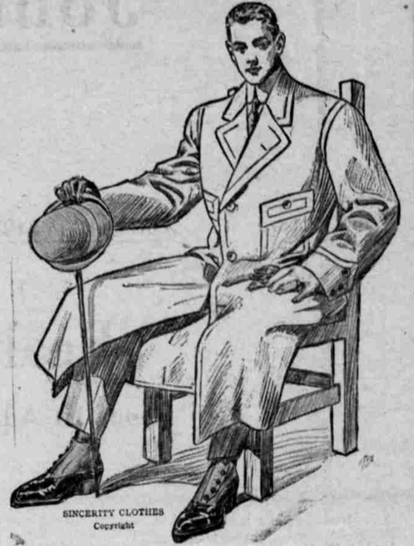
SINCERITY CLOTHES Copyright

carry the Sincerity label as a pledge to you of the WEAR AHEAD of the garment that bears it. High qualities at medium prices.