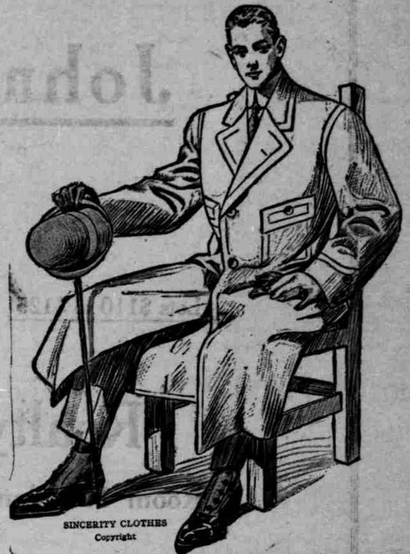
SINCERITY CLOTHES Copyright

carry the Sincerity label as a pledge to you of the WEAR AHEAD of the garment that bears it. High qualities at medium prices.