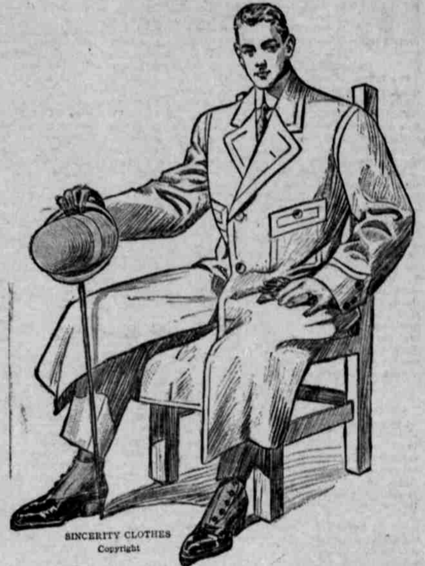
SINCERITY CLOTHES Copyright

carry the Sincerity label as a pledge to you of the WEAR AHEAD of the garment that bears it. High qualities at medium prices.