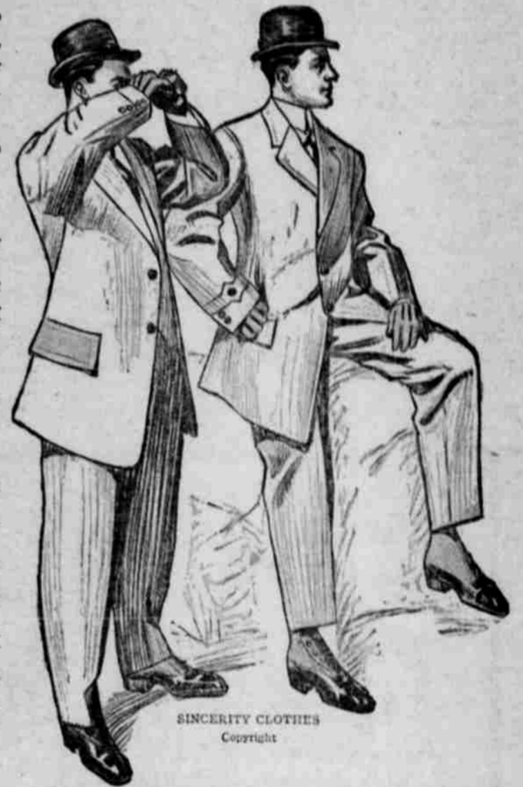
SINCERITY CLOTHES Copyright

For Fall and Winter have been selected with the view of satisfying those who demand the best styles, best materials, best workmanship, and best fit at moderate prices. Will be pleased to have you come in and try on a few suits.