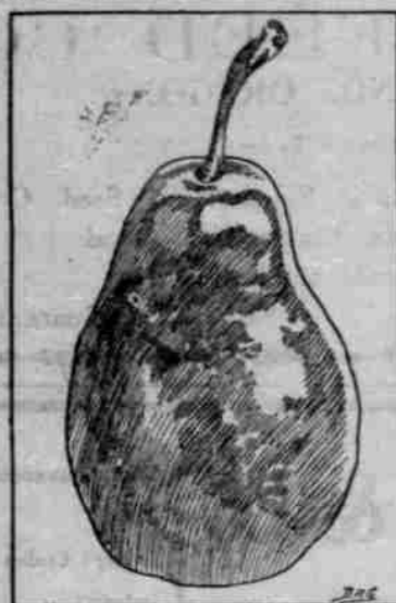
LOUISE BONNE PEAR.

The Louise Bonne Pear. A good midsenson pear, the Louise Bonne, is one of the best known market varieties and has always been popular in various localities because of its great productiveness and general good qualities. The tree is hardy everywhere that pears succeed, and it does