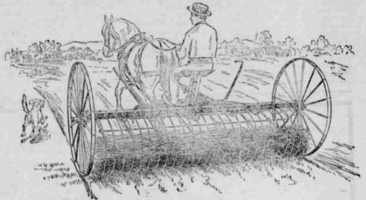
Deering Ideal Self-Dump Rake