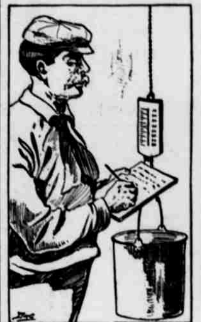
WEIGHING THE MILK.

A spring scale with a pointer for the tare of the pail now makes the weighing of the milk easy and quick. This scale can be had from almost any hardware store at a small price, and the milk pails can be made of uniform weight by putting a little lead on the bottom of the lighter ones. The producer can buy milk record sheets, good for a month, with spaces for keeping the weights of milk from over thirty cows, morning and night, at a cost of 15 cents a year. These sheets, tacked on a board near the scale, with a pencil hanging by a string, make it easy to weigh and set down the result, which shows at a glance what every cow is doing in quantity of milk. This, carried out through the year, will be a great surprise to the producer, disclosing unsuspected good and bad qualities in his cows. The yield of milk, however, is only a part of the value of the cow. To