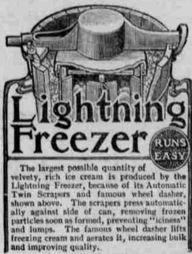
The largest possible quantity of velvety, rich ice cream is produced by the Lightning Freezer, because of its Automatic Twin Scrapers and famous wheel dasher, shown above. The scrapers press automatically against side of can, removing frozen particles soon as formed, preventing "iciness" and lumps. The famous wheel dasher lifts freezing cream and aerates it, increasing bulk and improving quality.

Economize by using the Lightning Freezer, it requires less ice.