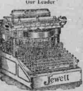
Double Key Board