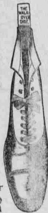
The Built-up Shoe.

Unexcelled for style, durability and comfort. The best of everything used in the construction of these shoes. Try a pair and you will buy only THE BILT-WELL SHOE.