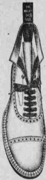
White Oak Shoes.