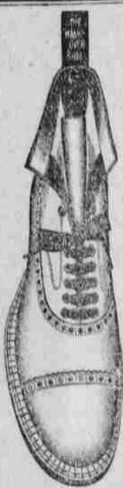
White Oak Shoes.

The Columbia Southern surveyors are camped at Heister station and are finishing the survey onto the plains in the Willow creek basin as fast as possible. Application has been filed in the land office at The Dalles for an extension of ten miles from Shaniko and more will be filed as the survey progresses.