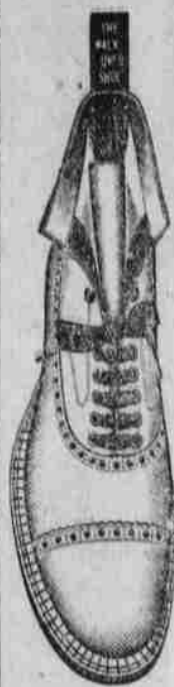
White Oak Shoes.