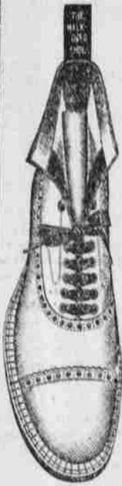
White Oak Shoes.