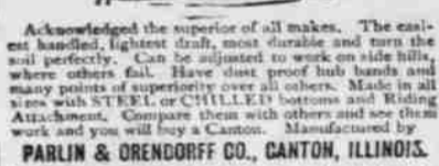
Acknowledged the superior of all makes. The easiest handled, lightest draft, most durable and turns the soil perfectly. Can be adjusted to work on side hills, where others fail. Have steel plow handles and many points of superiority over all others. Made in all sizes with STEEL or CHILLED bottoms and Riding Attachment. Compare them with others and see that work and you will buy a Canton. Manufactured by PARLIN & ORENDOFF CO., CANTON, ILLINOIS.

You will need a few new farming tools. The great P. & O. anton of Canton, Ill. is undoubtedly the best. The Canton Chilled and Steel plows, cultivators, harrrows, etc., being made of high-grade material with first class workmanship, have stood the test since 1842 and retained the procession by several