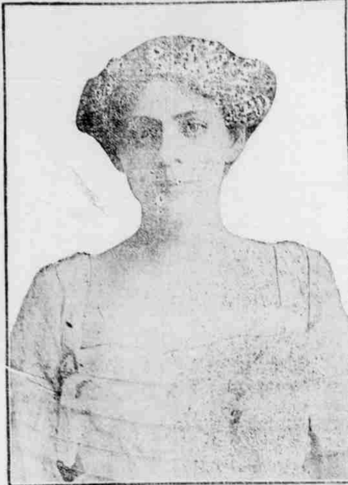
MISS ETHEL BARRYMORE'S TRIUMPHS IN LONDON SOCIETY.

These prices for labor must certainly go down as soon as there is any material let up in business. Personally I have always been an advocate of good pay, short hours, steady employment and good, faithful service, trying to keep all our employees thoroughly interested in the business. The weakest point in the government of the country today and the one that is destined to bring us the greatest trouble unless we have an immediate change is THE LAX ENFORCEMENT OF LAWS. THERE IS NOTHING WE NEED IN THIS COUNTRY SO MUCH, I REPEAT, AS RESPECT FOR AND HONEST ENFORCEMENT OF THE LAWS AS AFFECTING EVERY CITIZEN, WHETHER EMPLOYER OR EMPLOYEE, AND WHEN LAWS ARE FOUND TO BE BAD THEY SHOULD BE REPEALED.