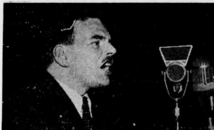
REPUBLICAN PRESIDENTIAL NOMINEE GOVERNOR THOMAS E. DEWEY calls for world agreements publicly made and publicly to be observed by ALL PARTIES, including "the victors and of such liberated countries as are willing to join in the endeavor." Vote for this policy November 7.