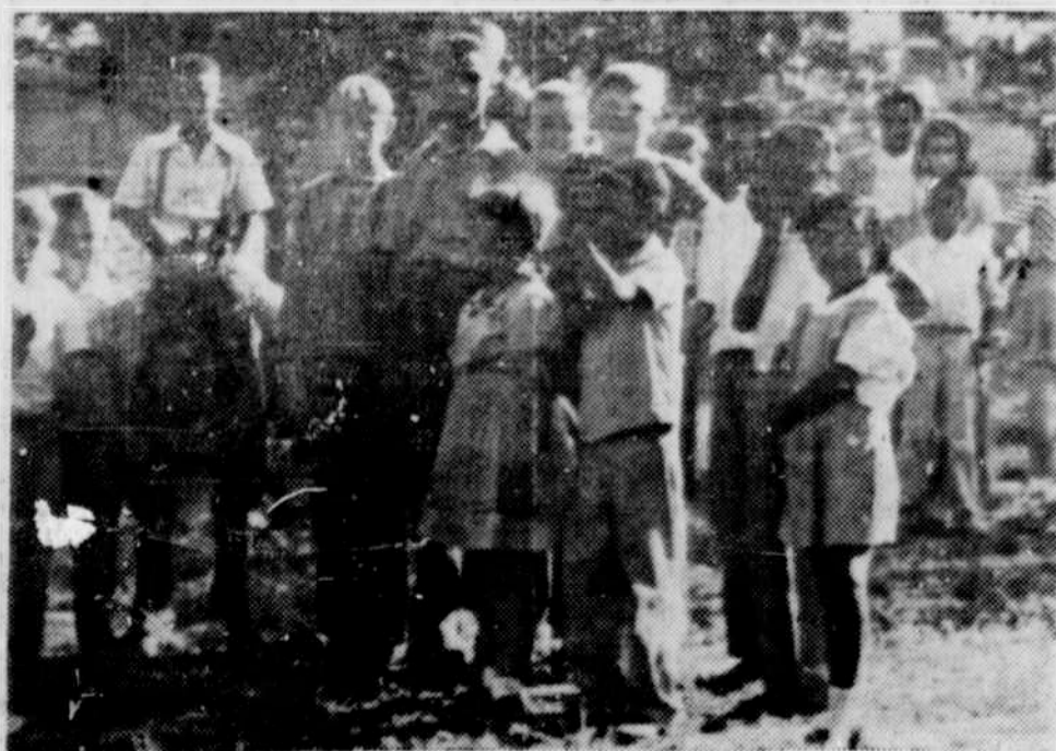
VANPORT CITY 4TH OF JULY PICNIC SCENES.