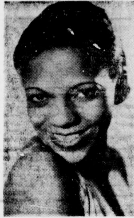
Ivy Anderson, formerly featured singer with Duke Ellington's band, is now on the floor show bill at the Cloud Room.