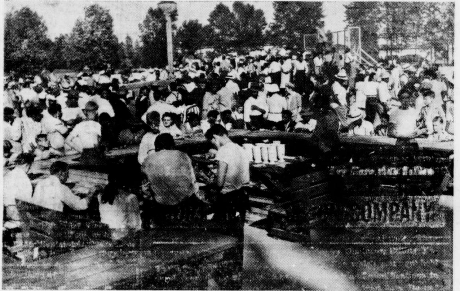
PLAYING BINGO AT VANPORT PICNIC