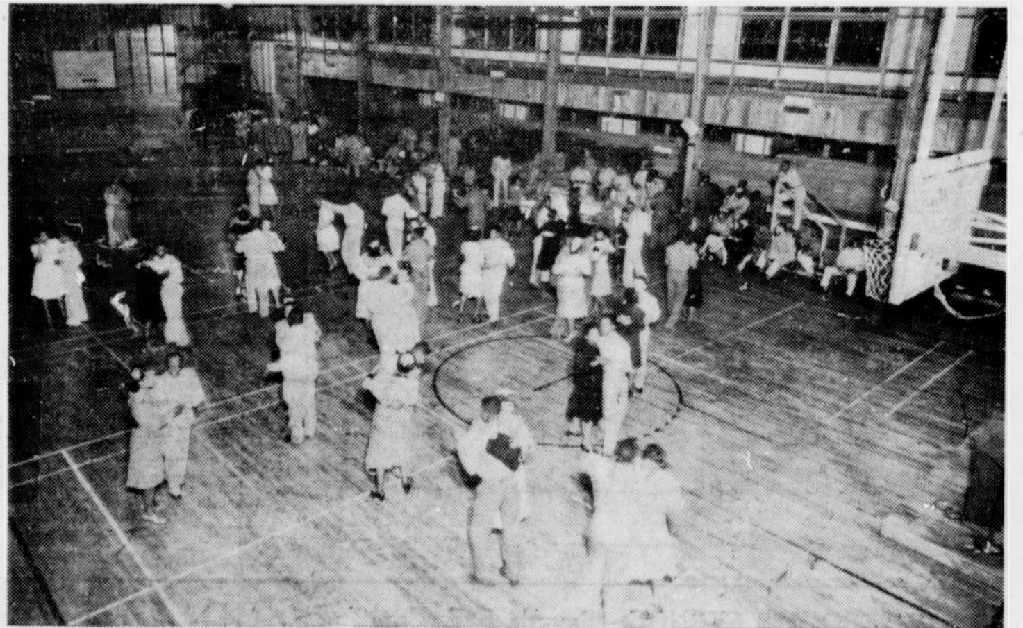
Who would not recognize these scenes? Of course this is just a sample of the very swell time that was enjoyed by everyone present at a recent dance at the Portland Army Air Base.

Homeowners will welcome news from the War Production Board that a limited production of electric water heaters has been approved. Further, the War Production Board established a new quota for production of non-electric water heaters. Restrictions also were removed from the manufacture or fabrication of metal jackets for water heaters. It was pointed out that metal jackets will be permitted again because paperboard proved unsatisfactory.