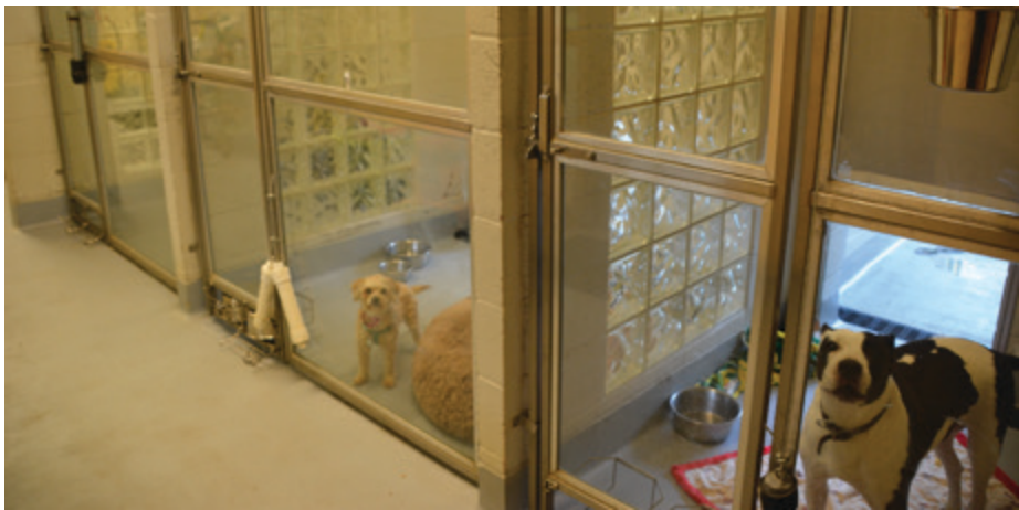
Dogs wait to be adopted at the Marion County Dog Services shelter. The shelter's manager says more than 94% of dogs left there find a home.