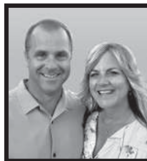
Oregon Licensed Real Estate Brokers