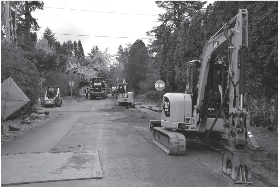
Keizer Public Works installs new water line on Joan Dr. in Keizer beginning April.