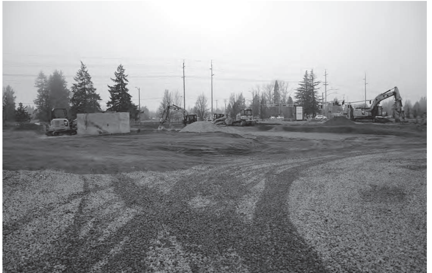
Crews from Rich Duncan Construction are in the infancy stages of building the Willamette Valley's first Chick-fil-A.

The timetable for completion of this project has yet to be released.