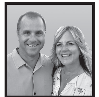
Oregon Licensed Real Estate Brokers