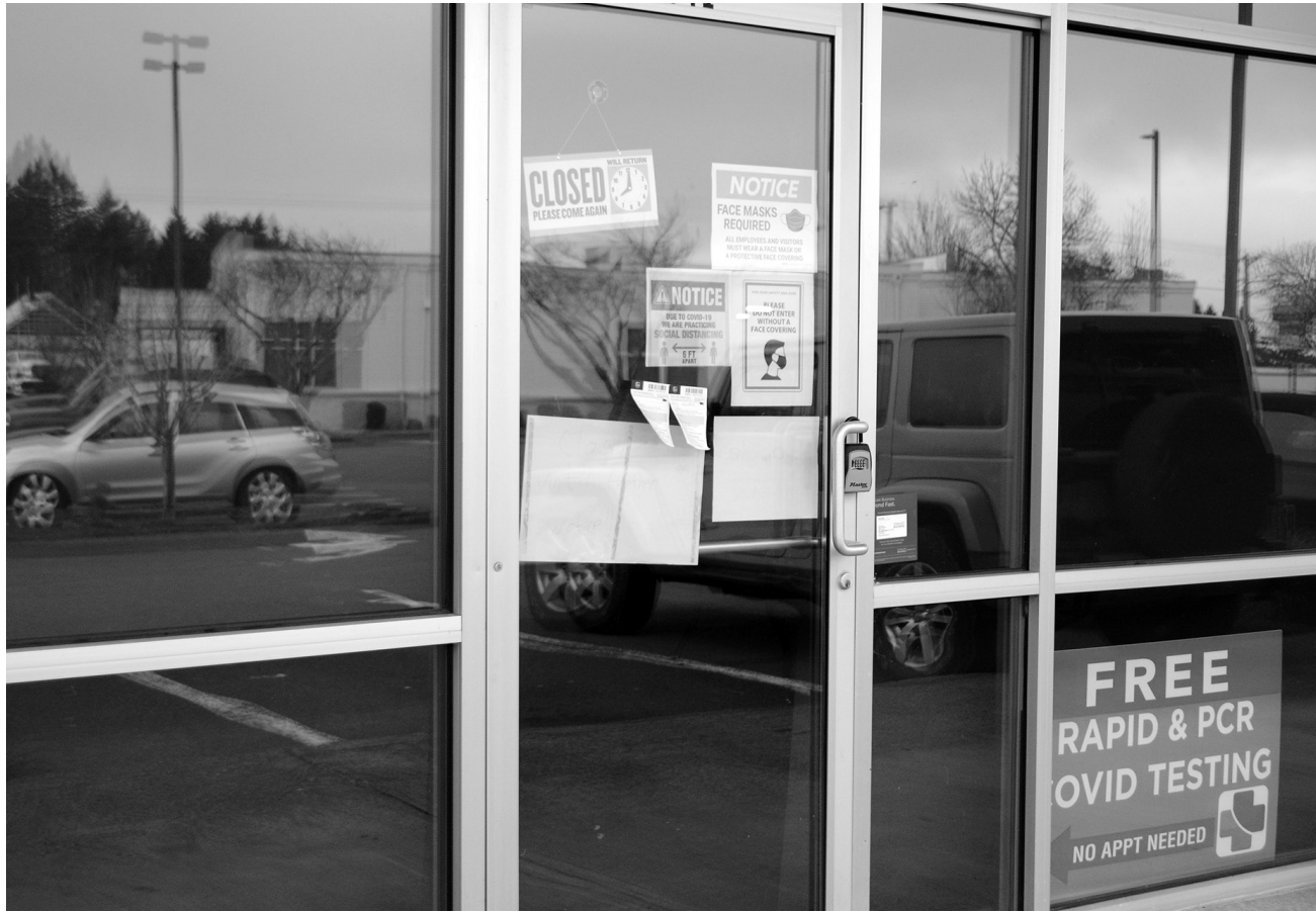
A testing center in South Salem displays The Center for Covid Control Salem logo.