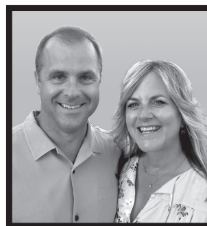
Oregon Licensed Real Estate Brokers