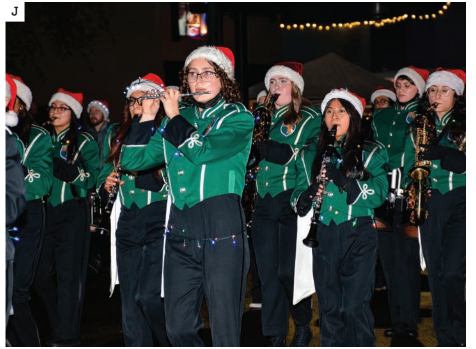
A: Best use of lights. B: Best Theme. C: Crater made an appearance at the parade. D: Best Theme. E: Boy Scouts Pack 150. F: McNary High School band. G: The Grinch waves to the crowd. H: Keizer Fire District. I: Mayor's Choice. J: McKay High School band.