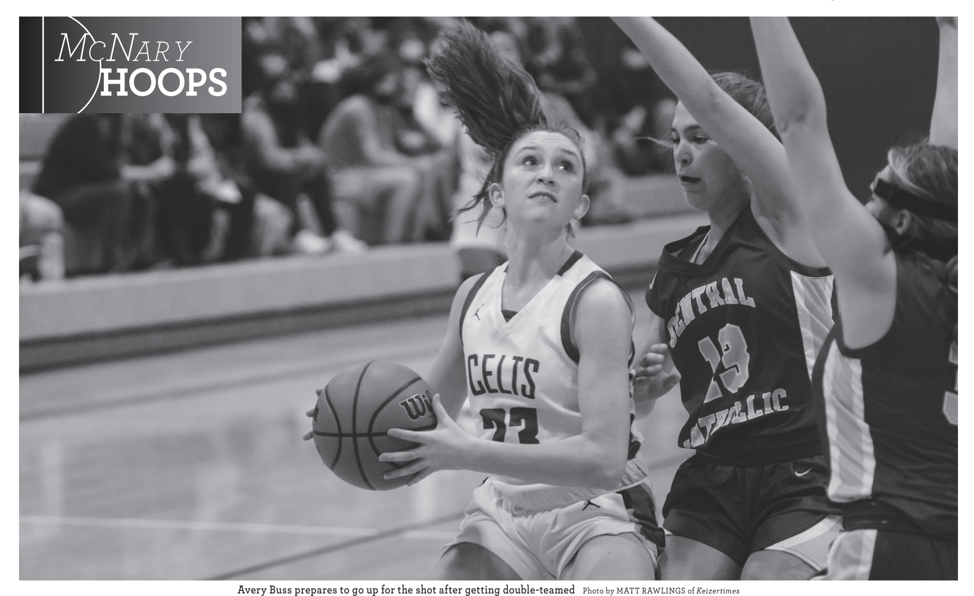
BY MATT RAWLINGS Of the Keizertimes

The shorthanded McNary girls basketball team kept the score within single-digits for most of the contest, but couldn't contain Central Catholic's Gretta Baker down the stretch.