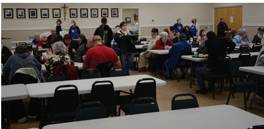
Hungry locals enjoy the pre-Thanksgiving Keizer Community Dinner on Wednesday, Nov. 24 at St. Edwards Church.