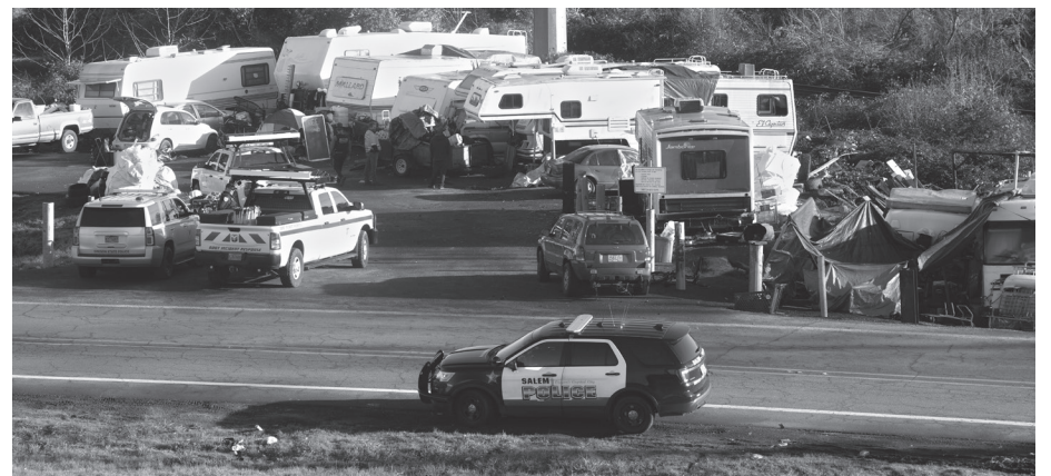
ODOT officials say the campers have blocked access to a private farm at times.