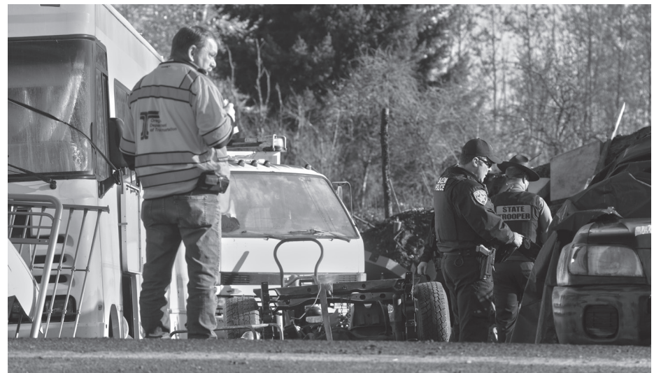
Officers walk through the camp but didn't directly help with cleanup. An inmate crew was brought in to help clear the area.