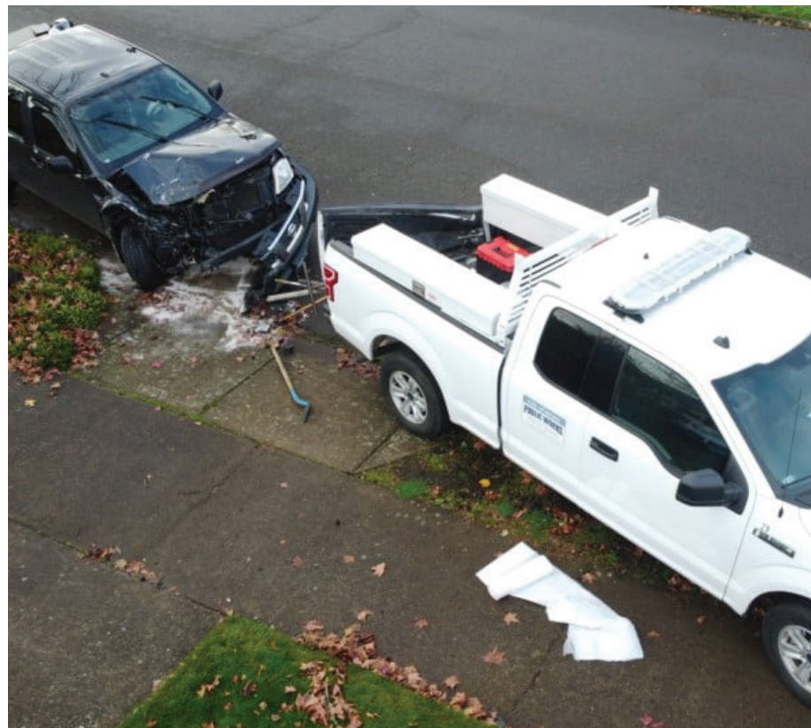
The aftermath of the crash which resulted in the arrest of Monica Batsell.