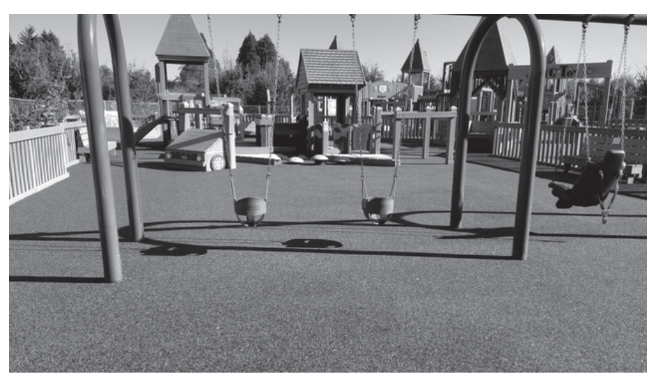
The Big Toy at Keizer Rapids Park.