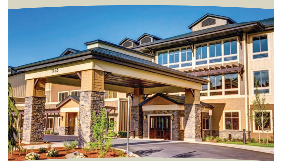
Quality senior living for those who have reached the age of sixty-two.