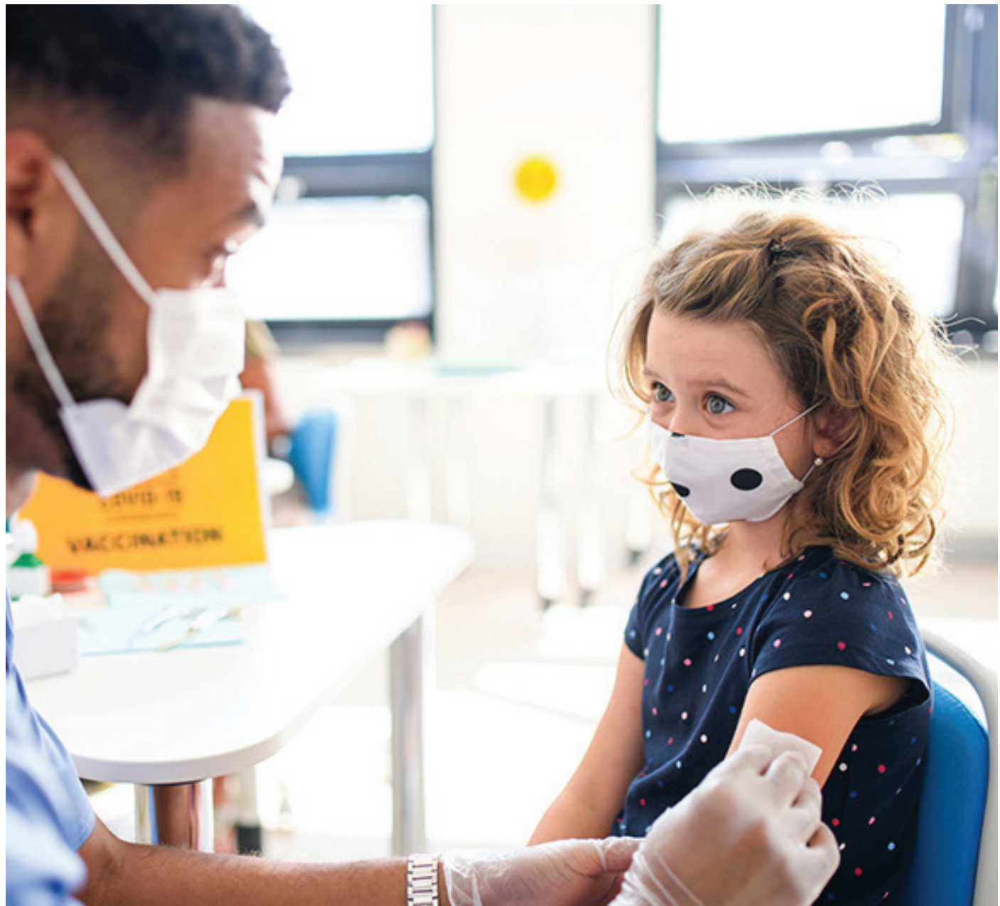
Kids in Oregon, ages 5 to 11, can now receive the Pfizer vaccine.

Parents are encouraged to check the vaccine provider’s requirements for consent and accompanying minors before going to the appointment.