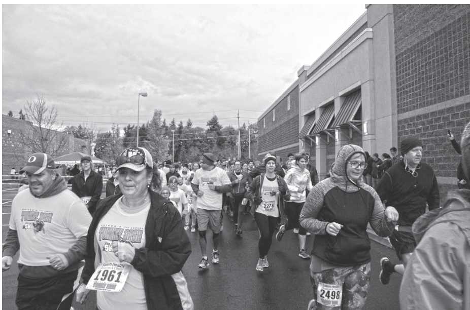
Locals participate in the 2018 Turkey Dash at Keizer Station.

Those interested in joining can register online at https://register.chrono-track.com .