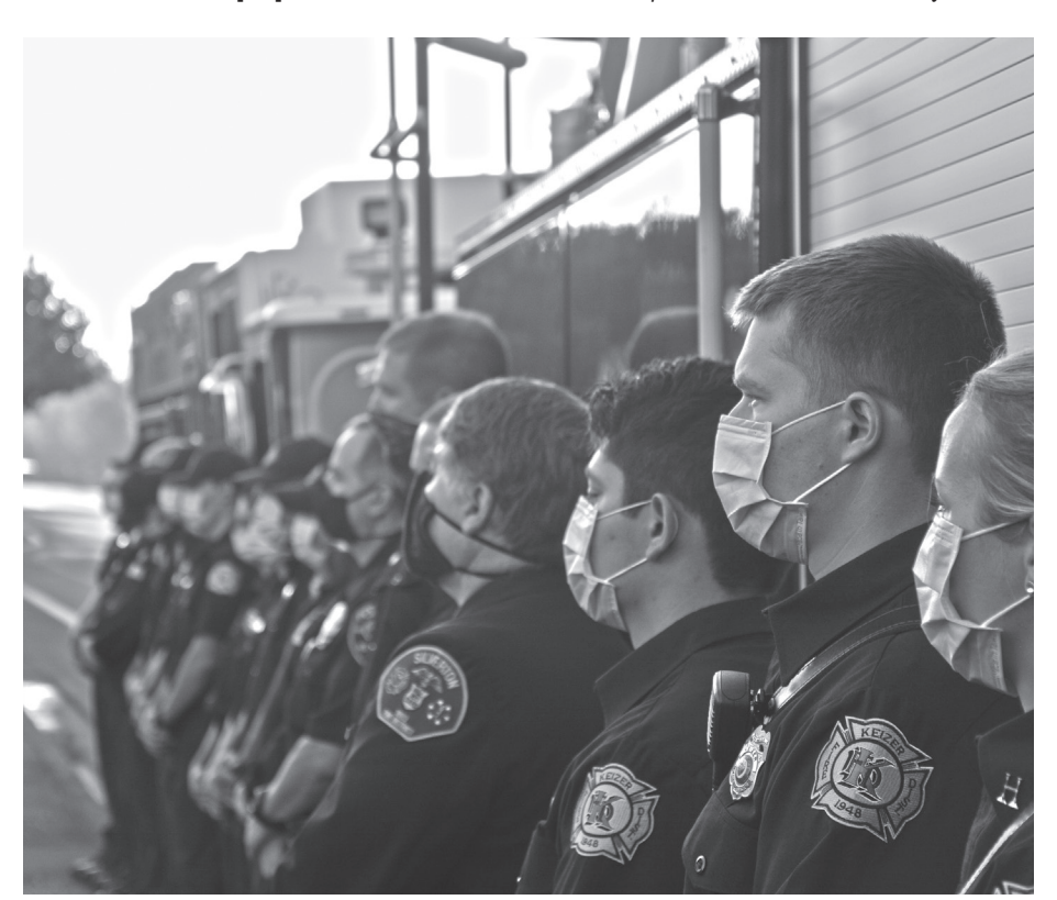
Keizer firefighters observe the ceremony.