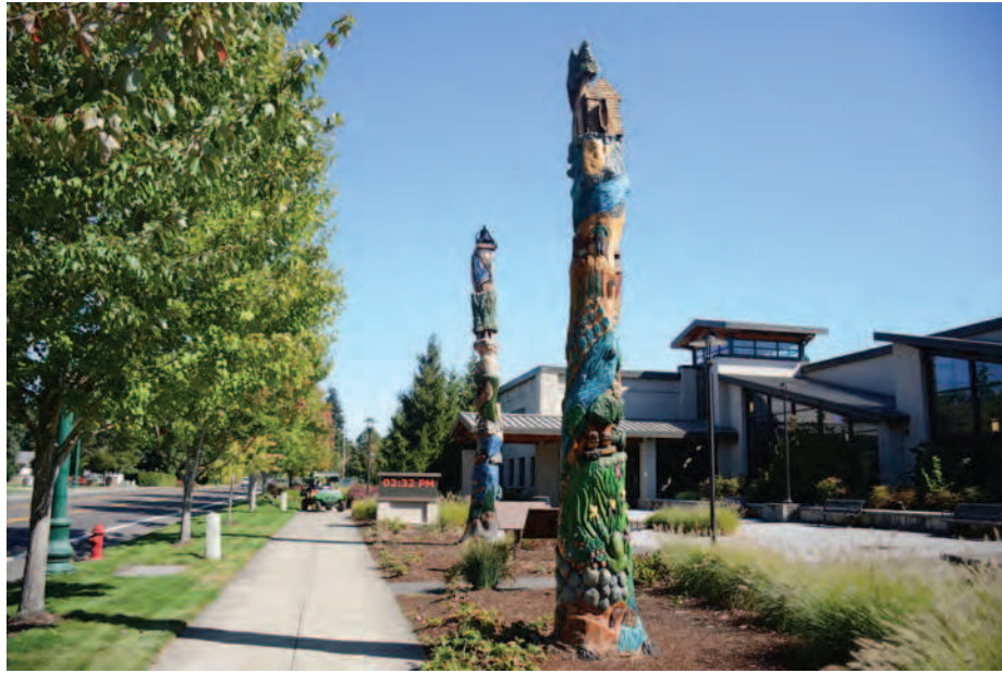
The Keizer story poles outside of City Hall on Chemawa Rd. will be dedicated this Saturday.