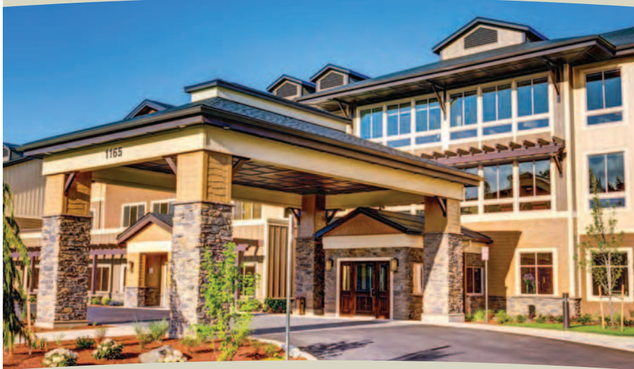
Quality senior living for those who have reached the age of sixty-two.