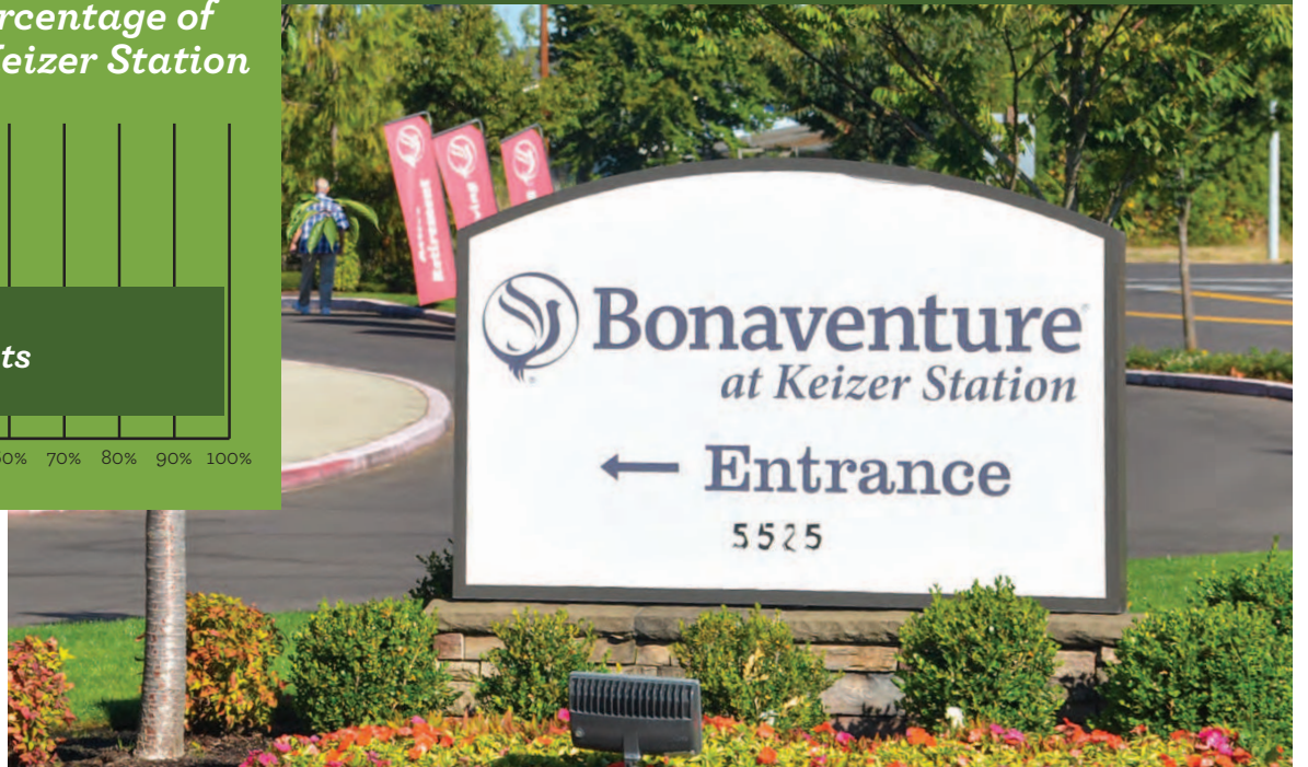
Bonaventure operates senior living communities throughout Oregon, Washington and Colorado.