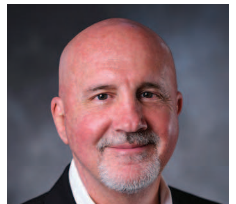
STATE REP. BILL POST