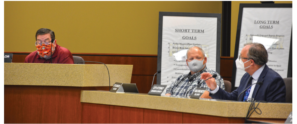
Keizer city councilors discuss the hiring of a new city manager at Tuesday's meeting.