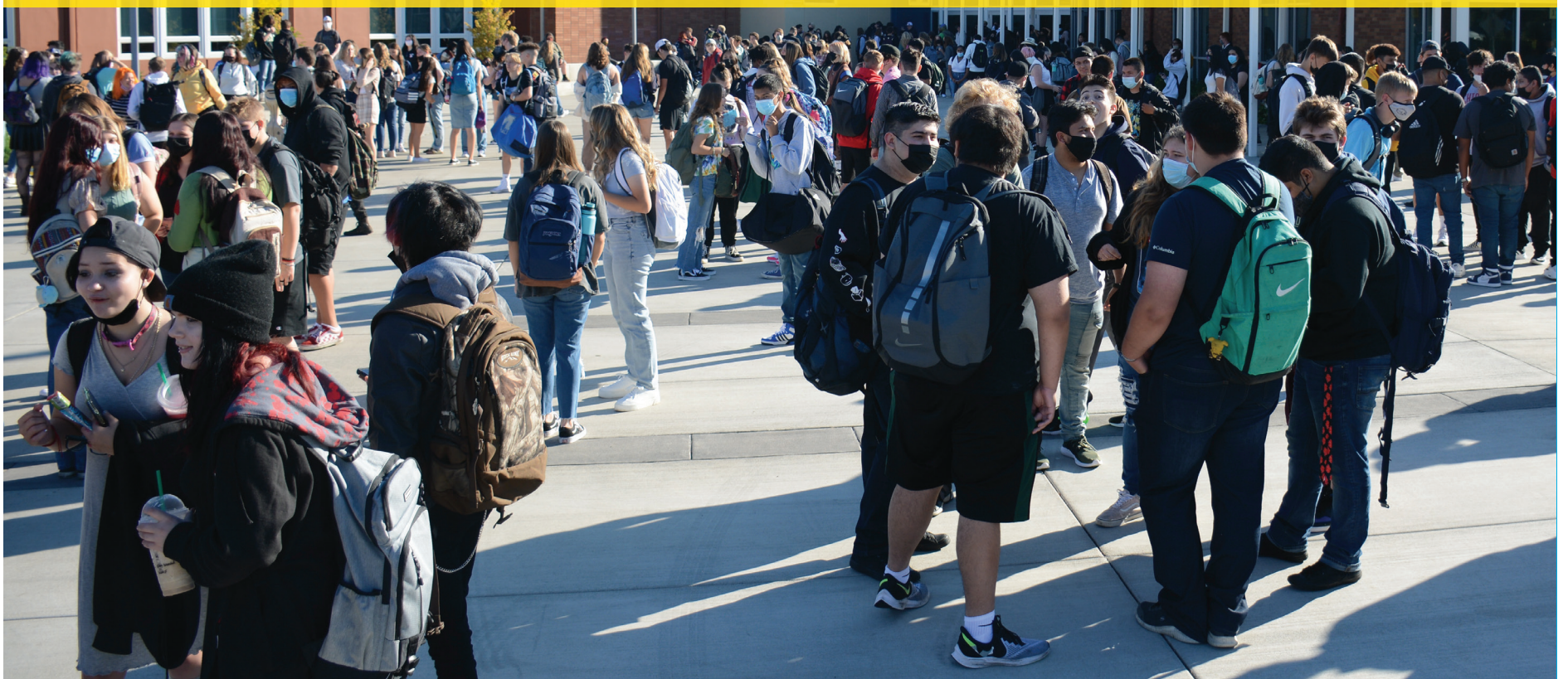
McNary students gather around the front of the school for their first day of in-person instruction.

For the first time since March 2020, Salem-Keizer schools are back to full, in-person instruction.