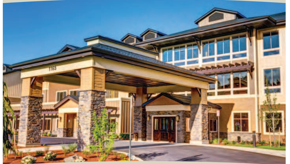
Quality senior living for those who have reached the age of sixty-two.