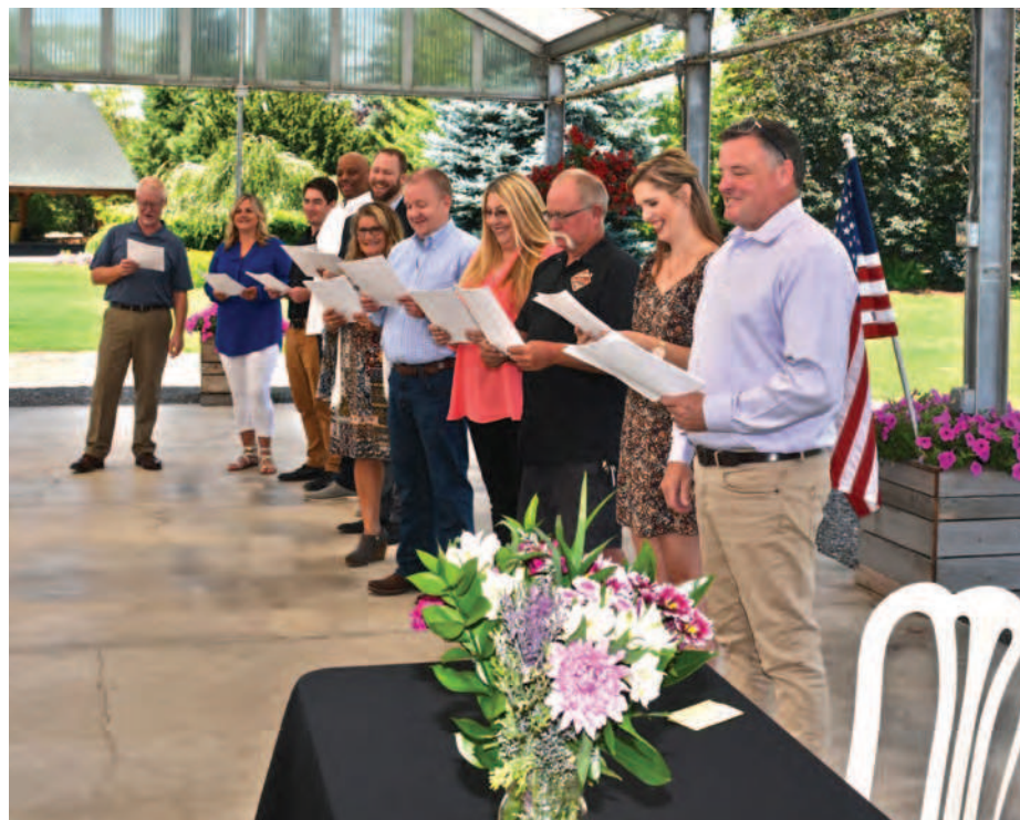
The new board of directors for the Keizer Chamber were introduced at a luncheon on Monday, July 13 at Log House Gardens.