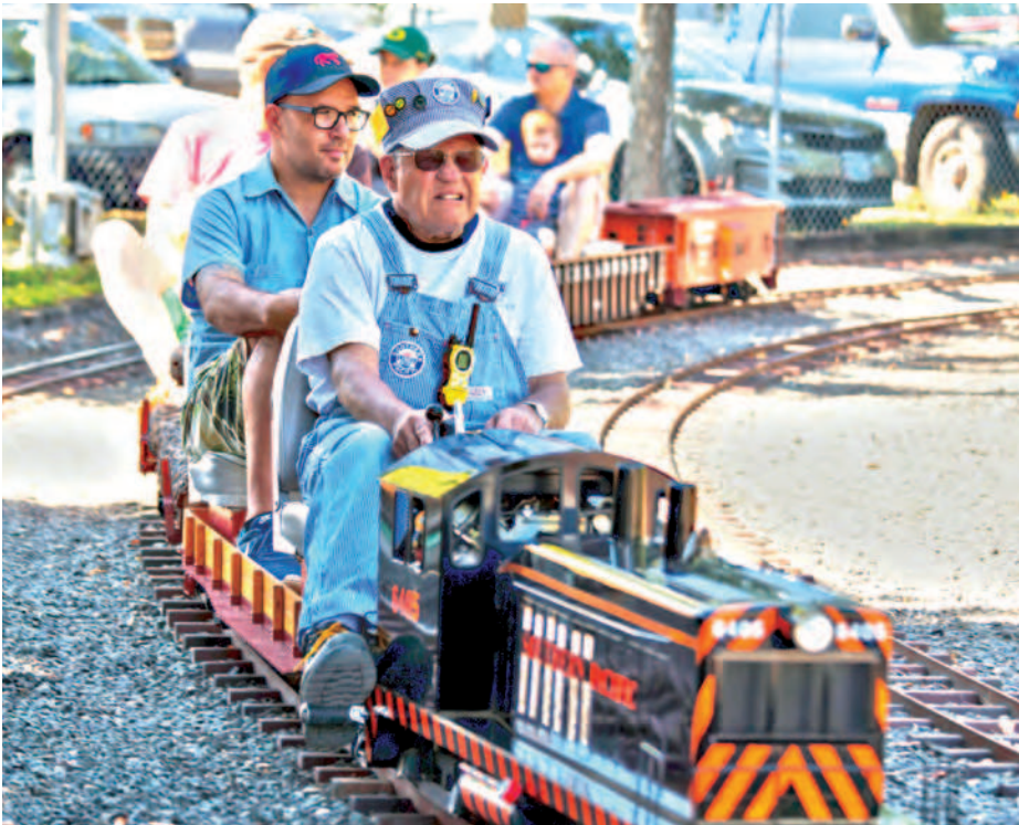
Attendees enjoy the mini railroad ride at the 2018 Great Oregon Steam Up.