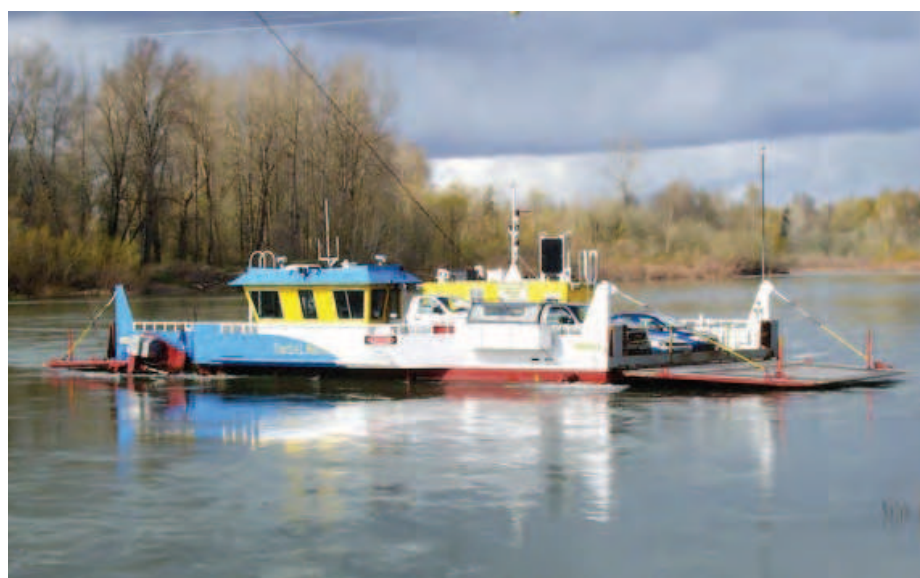
Two swimmers went missing Saturday, June 26, one near the Wheatland Ferry just north of Keizer.

Two men are missing in separate swimming incidents that took place Saturday, June 26.